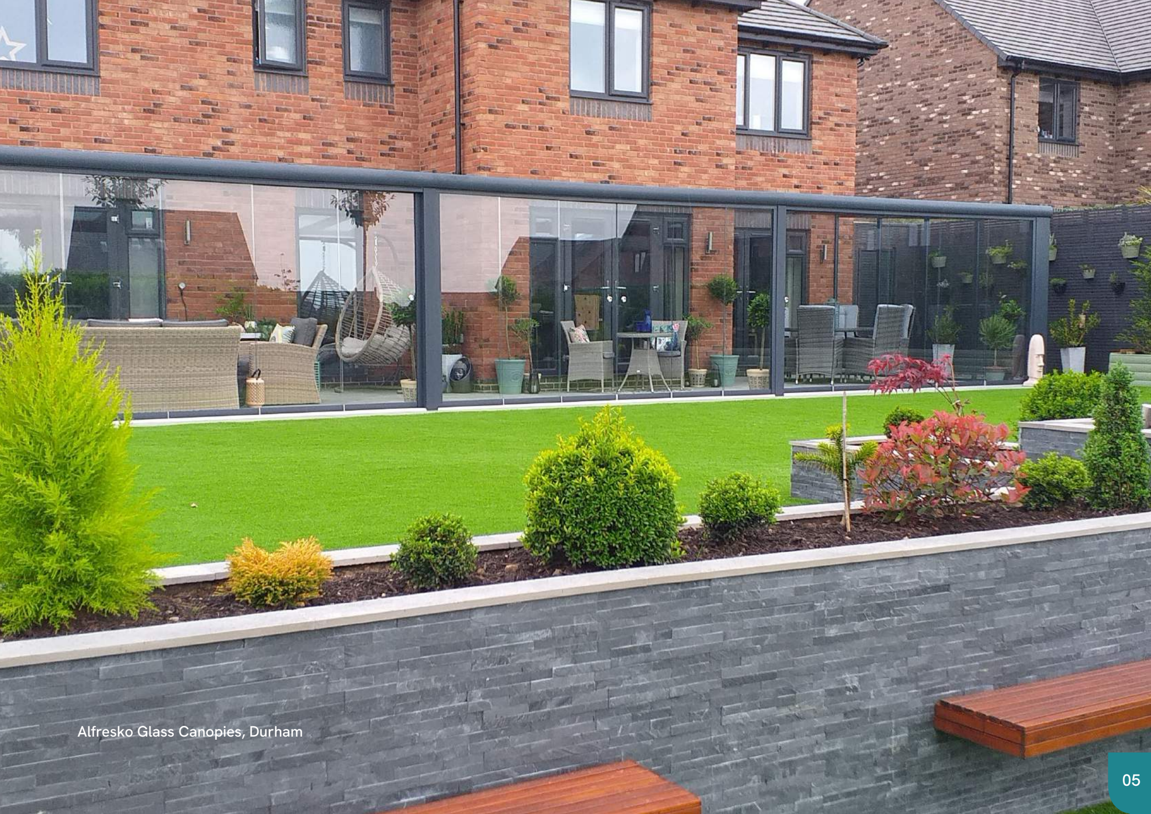
Alfresco Glass Canopies, Durham